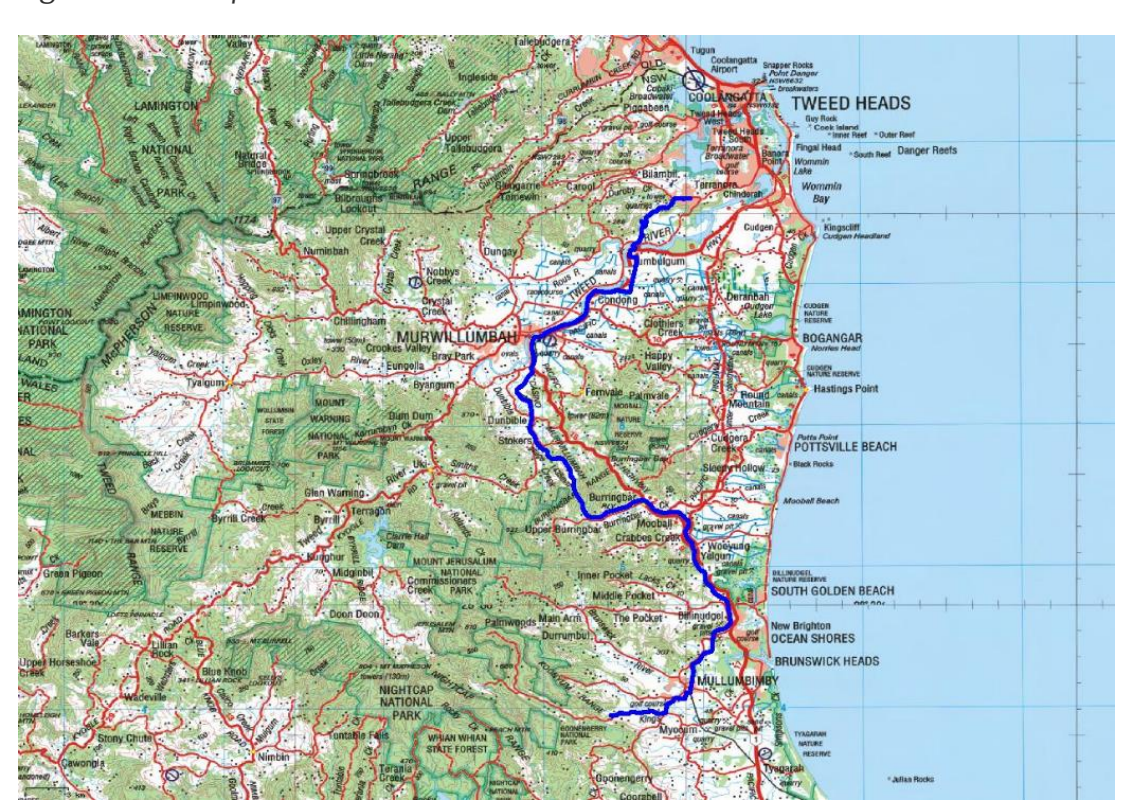
Figure 2-2—Map of the Directlink transmission route

Directlink plays a key role in the transmission of electricity between the Queensland and NSW NEM regions. For example, in 2018 more than 300,000 MW of electricity flowed across Directlink. The flow of electricity across Directlink facilitates significant benefits to the NEM and contributes to lower electricity prices for consumers.