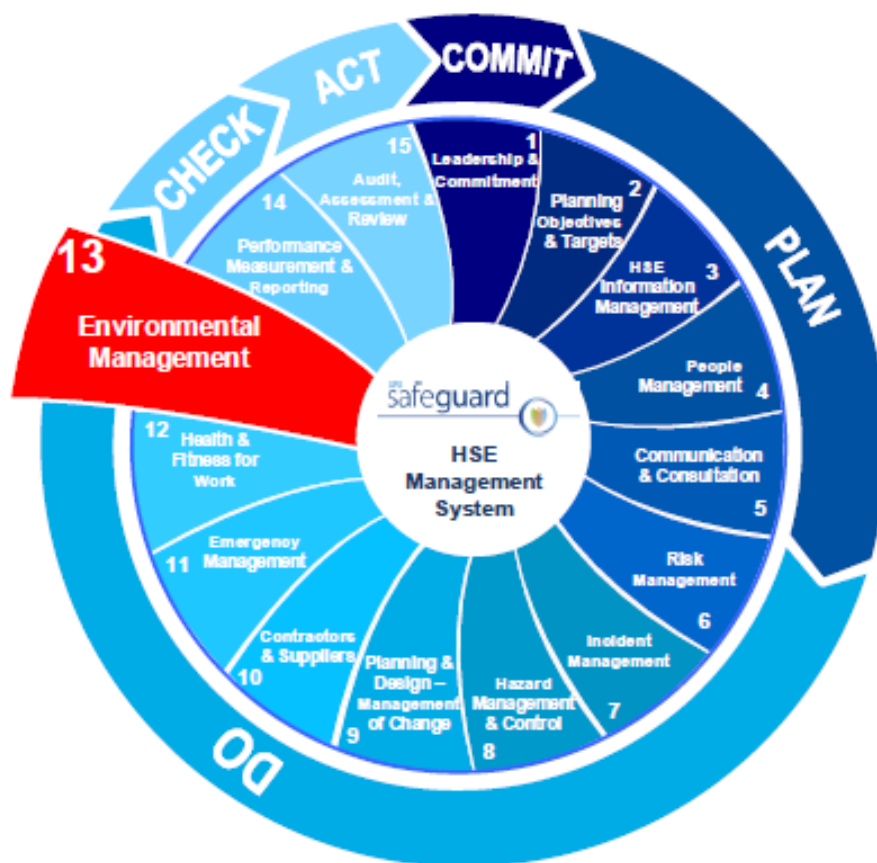
Figure 19-1 Safeguard risk management system

APA is committed to responsible environmental management and has formalised this commitment in a Health, Safety and Environment Policy. All personnel are required to work in line with APA’s HSE Policy which will be displayed in the site offices during Project activities.